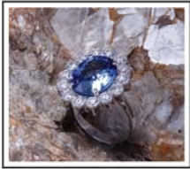
R2639: White Gold: 6.51gr Diamonds: 2.59ct Sapphire: 7.16ct