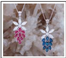
From left to right: P2692: White Gold: 5.70gr, Marquise Diamonds: 1.79ct, Round Diamonds: 0.23ct, Rubies: 2.80ct P2693: White Gold: 5.60gr, Marquise Diamonds: 1.79ct, Round Diamonds: 0.23ct, Sapphires: 4.01ct