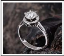
R2472: White Gold: 4.39gr Solitaire Diamond: 2.14ct Diamonds: 0.12ct