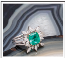
R1595: White Gold: 7.40gr Diamonds: 1.20ct Emerald: 2.66ct