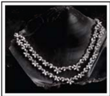
N2495: White Gold: 41.64gr Marquise Diamonds: 35.10ct Round Diamonds: 6.60ct