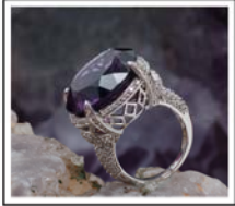
R0966: White Gold: 10.50gr Diamonds: 0.95ct Amethyst: 21.97ct