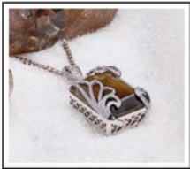
P1455: White Gold: 14.83gr Diamonds: 1.14ct Smoky Quartz: 63.42ct