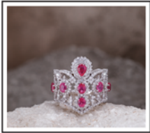
R1800: White Gold: 8.90gr Diamonds: 1.23ct Rubies: 1.75ct