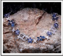
N2139: White Gold: 55.11gr Diamonds: 6.14ct Sapphires: 32.40ct