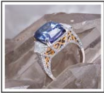
R2306: White & Yellow Gold: 7.20gr Diamonds: 0.85ct Tanzanite: 15ct