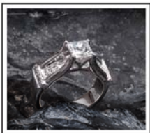
R0852: White Gold: 7.83gr Princess cut Diamond: 1.54ct Diamonds: 0.28ct