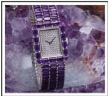
W1503: White Gold: 98.49gr Diamonds: 0.23ct Amethysts: 13.64ct