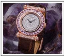
W1634: Rose Gold: 38.70gr Diamonds: 0.66ct Pink Sapphires: 3.53ct