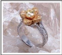
R2627: White & Yellow Gold: 14.33gr Canary Diamond: 1.20ct Diamonds: 1.45ct