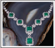
N1418: White Gold: 61.69gr Diamonds: 3.67ct Emeralds: 38.65ct