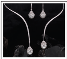
S2704: White Gold: 40.09gr Diamonds: 2.93ct Pearls: 14mm